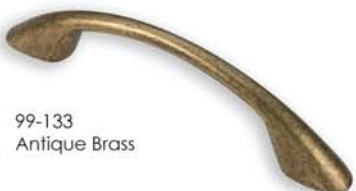
99-133 Antique Brass

OL: 134 mm (5.30") CC: 96 mm (3.75") W: 15 mm (0.60") P: 31 mm (1.20")