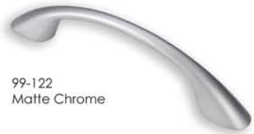
99-122 Matte Chrome