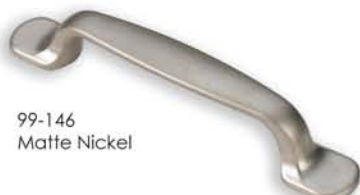
99-146 Matte Nickel