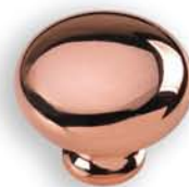
99-196 Bright Copper