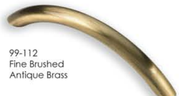
99-112 Fine Brushed Antique Brass