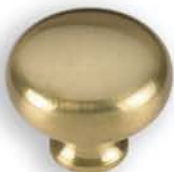
99-191 Fine Brushed Brass