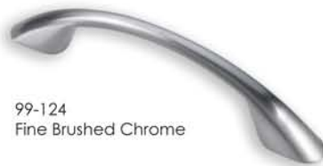
99-124 Fine Brushed Chrome