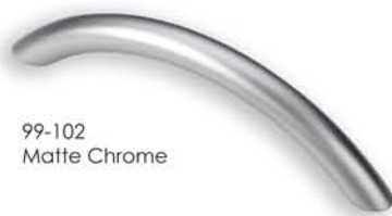
99-102 Matte Chrome