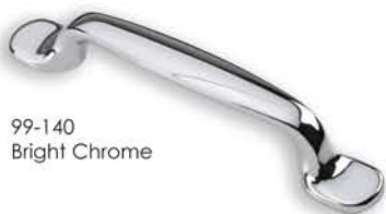
99-140 Bright Chrome