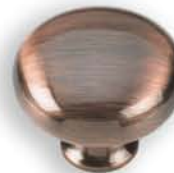
99-197 Fine Brushed Antique Copper