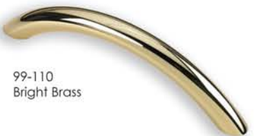
99-110 Bright Brass