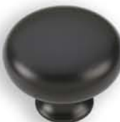
99-187 Matte Bronzed Nickel