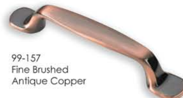
99-157 Fine Brushed Antique Copper