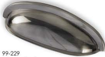
99-229 Fine Brushed Black Nickel