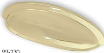
99-230 Bright Brass