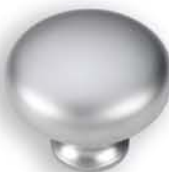
99-182 Matte Chrome