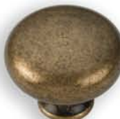
99-193 Antique Brass