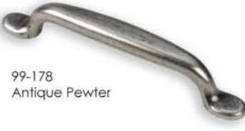
99-178 Antique Pewter