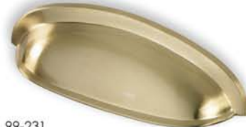
99-231 Fine Brushed Brass