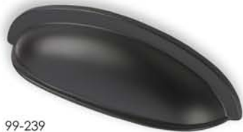
99-239 Oil Rubbed Bronze