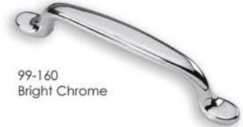
99-160 Bright Chrome