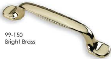
99-150 Bright Brass