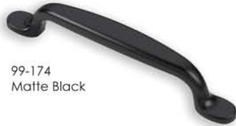
99-174 Matte Black