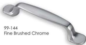
99-144 Fine Brushed Chrome