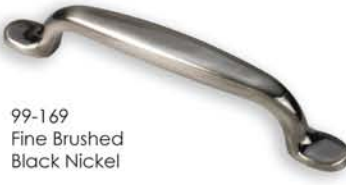
99-169 Fine Brushed Black Nickel