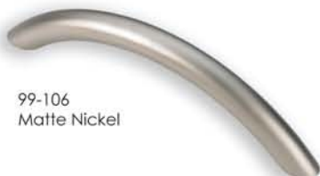
99-106 Matte Nickel