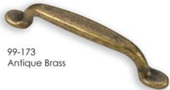
99-173 Antique Brass