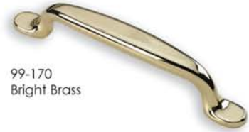
99-170 Bright Brass