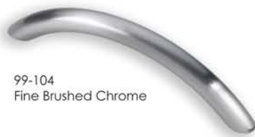
99-104 Fine Brushed Chrome