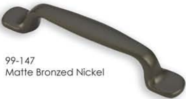
99-147 Matte Bronzed Nickel