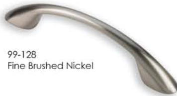
99-128 Fine Brushed Nickel