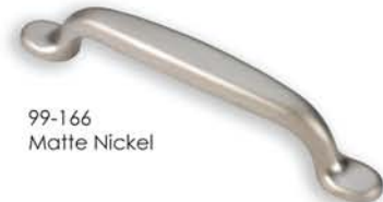
99-166 Matte Nickel