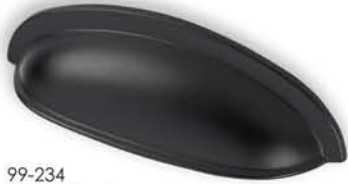
99-234 Matte Black