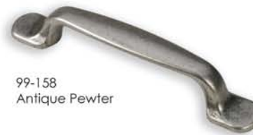
99-158 Antique Pewter