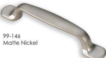
99-146 Matte Nickel