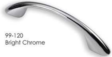
99-120 Bright Chrome