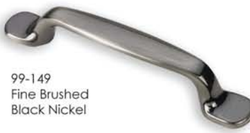
99-149 Fine Brushed Black Nickel