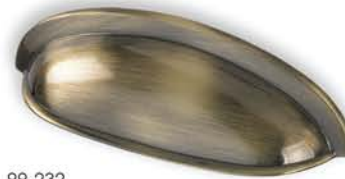
99-232 Fine Brushed Antique Brass