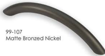
99-107 Matte Bronzed Nickel