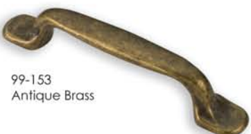
99-153 Antique Brass

OL: 129 mm (5.10") CC: 96 mm (3.75") W: 20 mm (0.80") P: 25 mm (1.00")