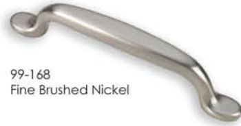
99-168 Fine Brushed Nickel