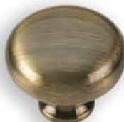
99-192 Fine Brushed Antique Brass