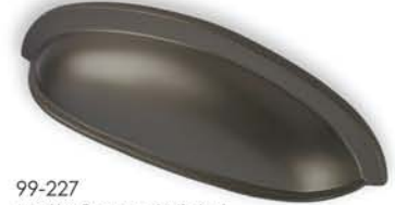
99-227 Matte Bronzed Nickel

OL: 116 mm (4.55") CC: 76 mm (3.00") W: 35 mm (1.40") P: 25 mm (1.00")