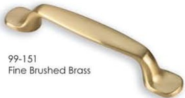
99-151 Fine Brushed Brass