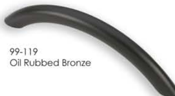
99-119 Oil Rubbed Bronze

OL: 110 mm (4.35") CC: 96 mm (3.75") W: 9 mm (0.35") P: 28 mm (1.10")