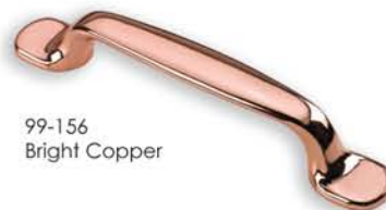
99-156 Bright Copper