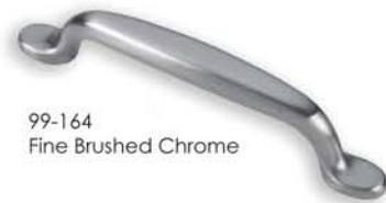
99-164 Fine Brushed Chrome