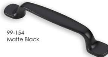
99-154 Matte Black