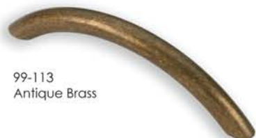
99-113 Antique Brass

OL: 110 mm (4.35") CC: 96 mm (3.75") W: 9 mm (0.35") P: 28 mm (1.10")