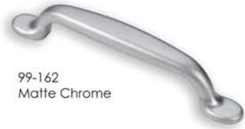
99-162 Matte Chrome