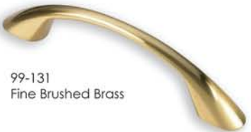
99-131 Fine Brushed Brass