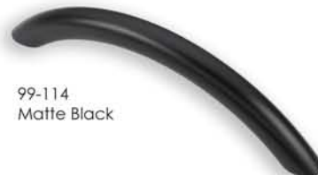
99-114 Matte Black