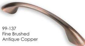
99-137 Fine Brushed Antique Copper