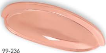
99-236 Bright Copper