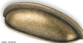
99-233 Antique Brass