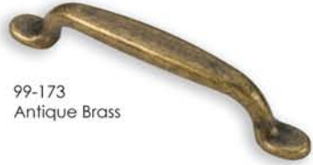
99-173 Antique Brass