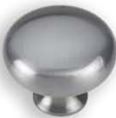
99-184 Fine Brushed Chrome