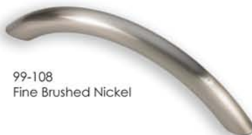
99-108 Fine Brushed Nickel