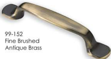
99-152 Fine Brushed Antique Brass