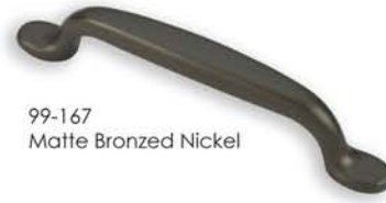
99-167 Matte Bronzed Nickel

OL: 132 mm (5.20") CC: 96 mm (3.75") W: 14 mm (0.55") P: 25 mm (1.00")