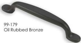
99-179 Oil Rubbed Bronze