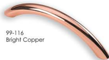
99-116 Bright Copper