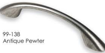
99-138 Antique Pewter