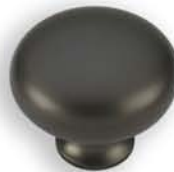
99-199 Oil Rubbed Bronze