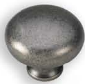
99-198 Antique Pewter