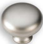
99-186 Matte Nickel