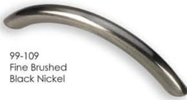
99-109 Fine Brushed Black Nickel