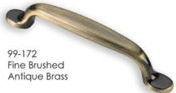
99-172 Fine Brushed Antique Brass