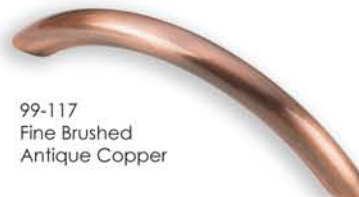
99-117 Fine Brushed Antique Copper