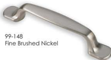
99-148 Fine Brushed Nickel