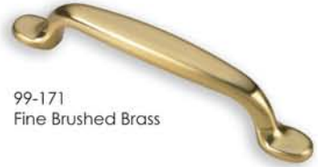
99-171 Fine Brushed Brass