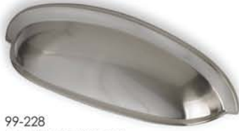
99-228 Fine Brushed Nickel