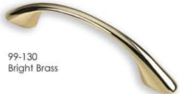
99-130 Bright Brass