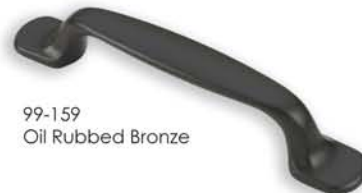
99-159 Oil Rubbed Bronze

OL: 129 mm (5.10") CC: 96 mm (3.75") W: 20 mm (0.80") P: 25 mm (1.00")