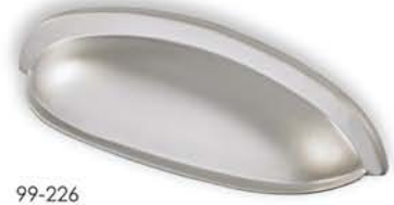
99-226 Matte Nickel