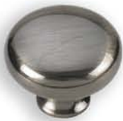
99-189 Fine Brushed Black Nickel