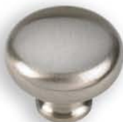
99-188 Fine Brushed Nickel