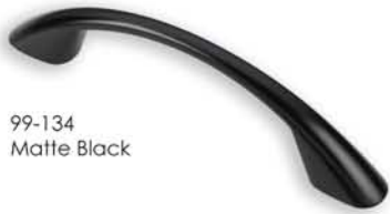
99-134 Matte Black