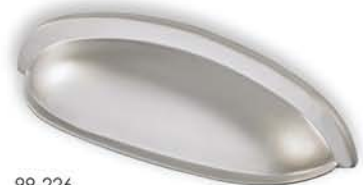
99-226 Matte Nickel