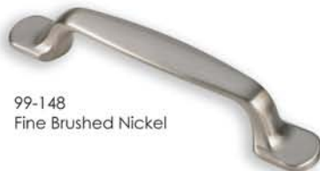
99-148 Fine Brushed Nickel