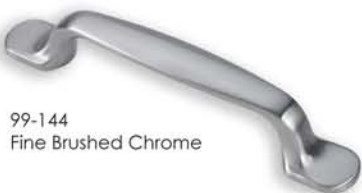
99-144 Fine Brushed Chrome