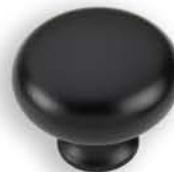
99-194 Matte Black