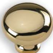
99-190 Bright Brass