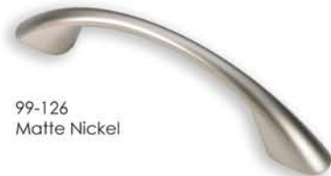
99-126 Matte Nickel