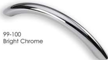
99-100 Bright Chrome