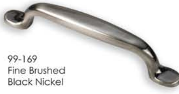
99-169 Fine Brushed Black Nickel