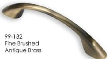
99-132 Fine Brushed Antique Brass