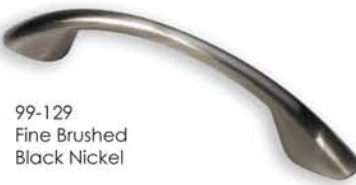
99-129 Fine Brushed Black Nickel