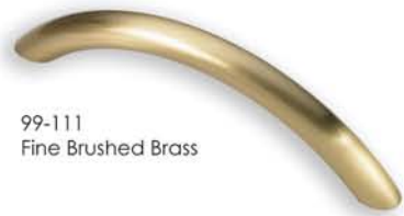
99-111 Fine Brushed Brass