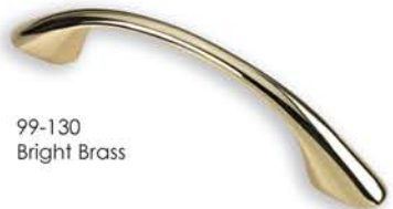
99-130 Bright Brass