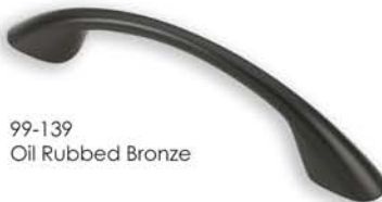
99-139 Oil Rubbed Bronze