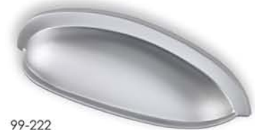
99-222 Matte Chrome