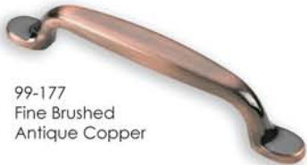
99-177 Fine Brushed Antique Copper