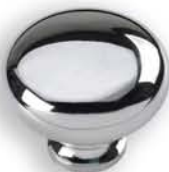
99-180 Bright Chrome