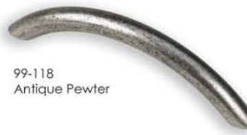
99-118 Antique Pewter