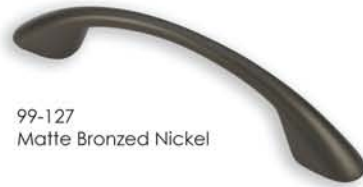
99-127 Matte Bronzed Nickel