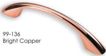
99-136 Bright Copper