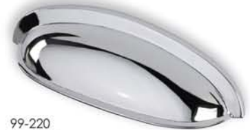
99-220 Bright Chrome