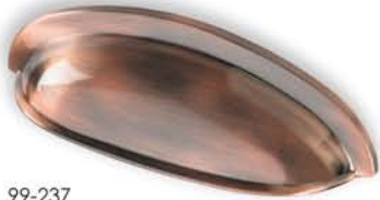
99-237 Fine Brushed Antique Copper