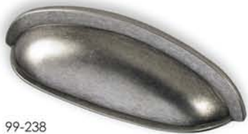
99-238 Antique Pewter