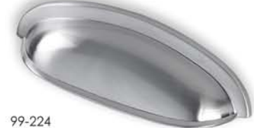
99-224 Fine Brushed Chrome